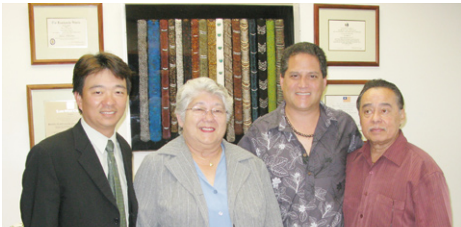
Senators English and Tsutsui meet with Maui County Mayor Charmaine Tavares and Council Chair Danny A. Mateo to discuss retaining the county's share of the Transient Accommodations Tax (TAT). March 24, 2010.