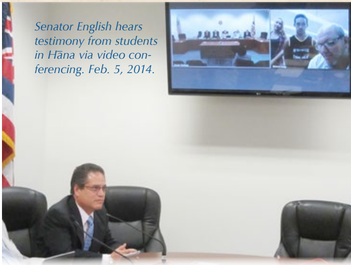
Senator English hears testimony from students in Hāna via video conferencing. Feb. 5, 2014.

“Increasing public access to government has always been a huge priority for me, especially in the remote areas of our State,” said Senator English, “And the utilization of modern technology is an effective way of achieving this goal. The measures before us impact our students and our schools and the policies we draft are strengthened by their input and ideas. I look forward to seeing more individuals use this tool to provide testimony.”