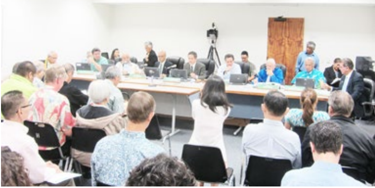
Senator English Chairs the Transportation and International Affairs committee in a joint hearing with the Public Safety and Military Affairs and Judiciary committees to pass out legislation. Feb. 4, 2014.