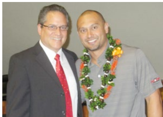
The Senate held a Congratulatory presentation for Boston Red Sox baseball star Shane Victorino of Maui. The commendation ceremony recognised The Shane Victorino Foundation which supports under-served youth in communities across the U.S. Jan. 28, 2014