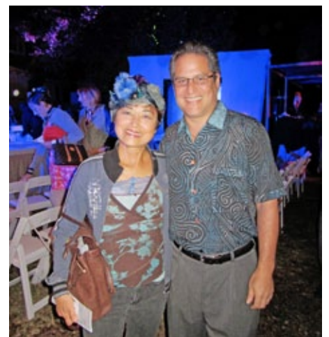
Sen. English and Emi Azeka enjoy the lantern lit runway fashion show presented by Makawao's Fashion District purveyors. April 20, 2012.