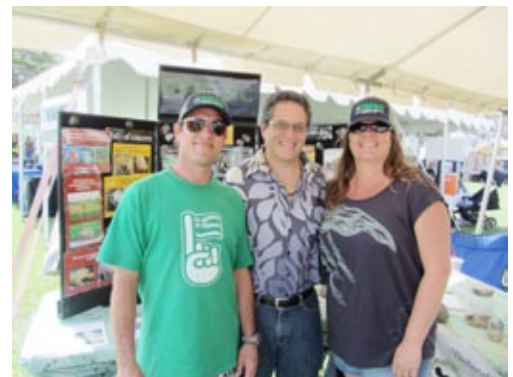
Sen. English visited the Maui Invasive Species (MISC) educational booth and activities during the East Maui Taro Festival. April 21, 2012.