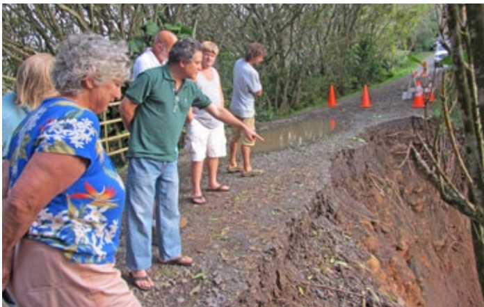
Sen. English meets with residents in Kailua following the collapse of Hanawana Bridge. Maui March 10, 2012.

Sen. English empathizes with the many families unable to drive from Hanawana to Hana Highway. “Had this been one of our 60 bridges, the whole east side of Maui would be completely cut off. Of the 60 bridges we have out there, 42 are deemed unsafe, which means even in good weather, it’s very difficult to pass,” said Sen. English, “Diligent evaluation of their condition is necessary.”