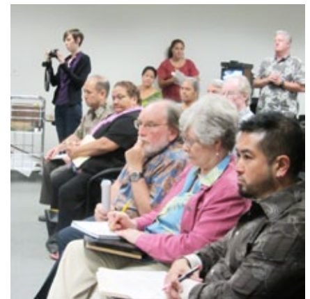
OHA Chair Colette Machado and Governor Abercrombie wait to testify in favor of SB 2783. March 6, 2012

View the status of SB2783 here: http://www.capitol.hawaii.gov/measure_indiv.aspx?billtype=SB&billnumber=2783