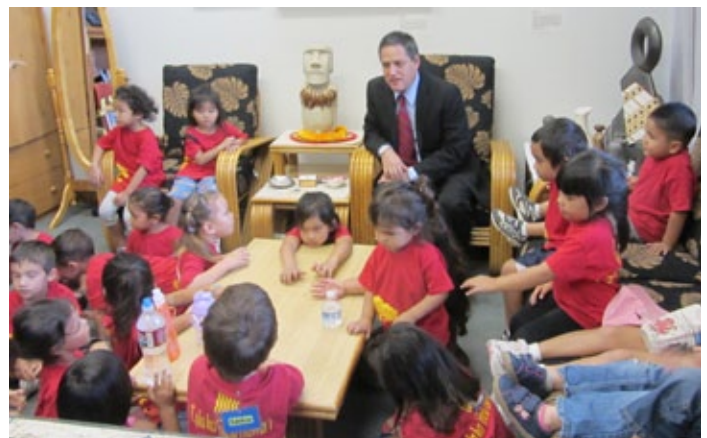
Hawaiian Language Immersion School students lobby for the preservation of the Hawaiian Language. March 20, 2012

http://www.capitol.hawaii.gov/measure_indiv.aspx?billtype=SB&billnumber=3010