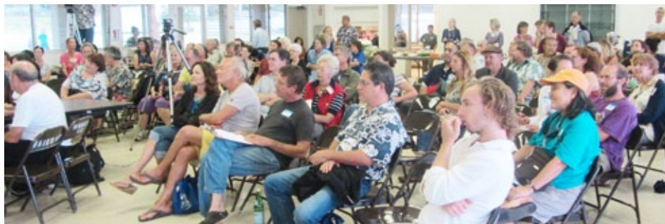
Below: Sen. English attends another spirited and informative Maui Farmers Union United (MFUU) meeting in Haiku. Aug 28, 2012.