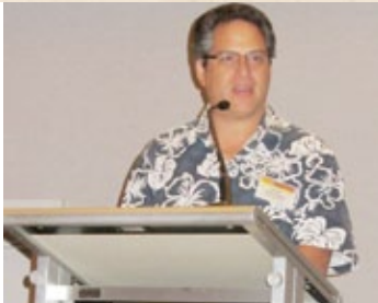
Above: Sen. English addresses attendees of the Asia-Pacific Disaster Risk Reduction Workshop. Below - Sen. English meets with representatives of the Office of the U.S. Secretary of Defense and the Pacific Disaster Center. August 15, 2012.

The inaugural Asia-Pacific Disaster Risk Reduction and Resilience, (APDR3) Asia-Pacific Resilience and Sustainability Workshop was held on Oahu on August 14th-16th, 2012. Senator English was invited to participate to help define a program and timeline for promoting resilience across the Asia-Pacific region, involving private industry, government and civil society.