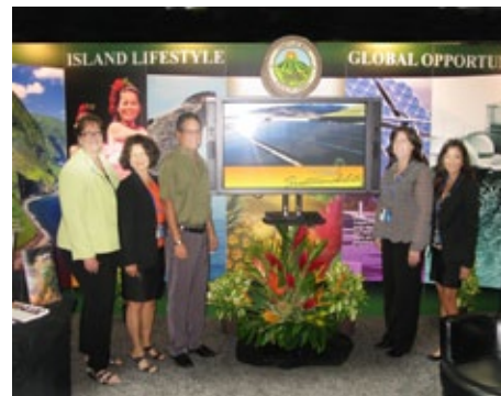
Sen. English visits officials of Maui County Economic Development Office booth at APEC in Honolulu. Nov. 7, 2011.