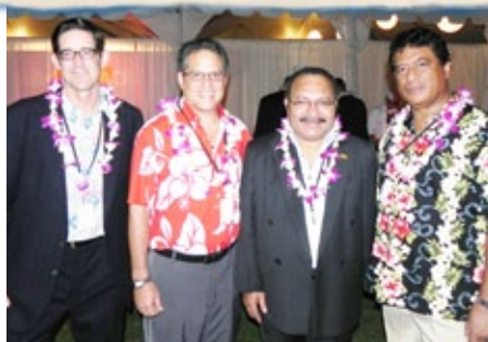
Pacific Island Leaders talk shop at APEC: Gerard Finin, Co-Director, Pacific Island Development Program, East-West Center; Sen. English; Peter O'Neill Prime Minister of Papua New Guinea; Lord Tu'ivakano, Prime Minister of the Kingdom of Tonga. Nov. 10, 2011.