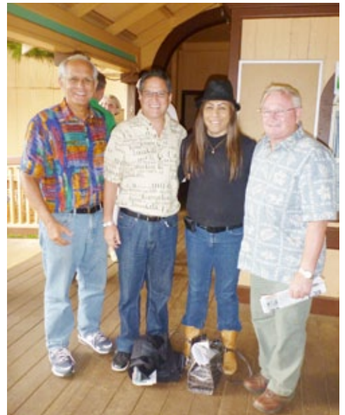
Senator English with members of the Senate and House Energy committees meet with the community to listen to their perspectives and concerns on the proposed wind farms in Maunaloa. Molokai, November 2, 2011.

Early in November, Senator English visited the islands of Molokai and Lanai. Concerns have been raised regarding the proposed 200-megawatt wind-farms on these islands and the undersea cable linking them to Oahu. In response to this, Senator English and the members of the Hawaii State Senate Committee on Energy and Environment as well as members of the State House Committee on Energy and Environmental Protection set up numerous listening sessions with the communities on both islands.