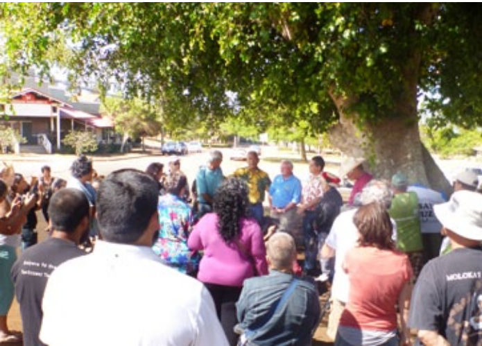
Maunaloa town meeting with the Senate and House Energy Committees on Moloka'i. November 2, 2011.