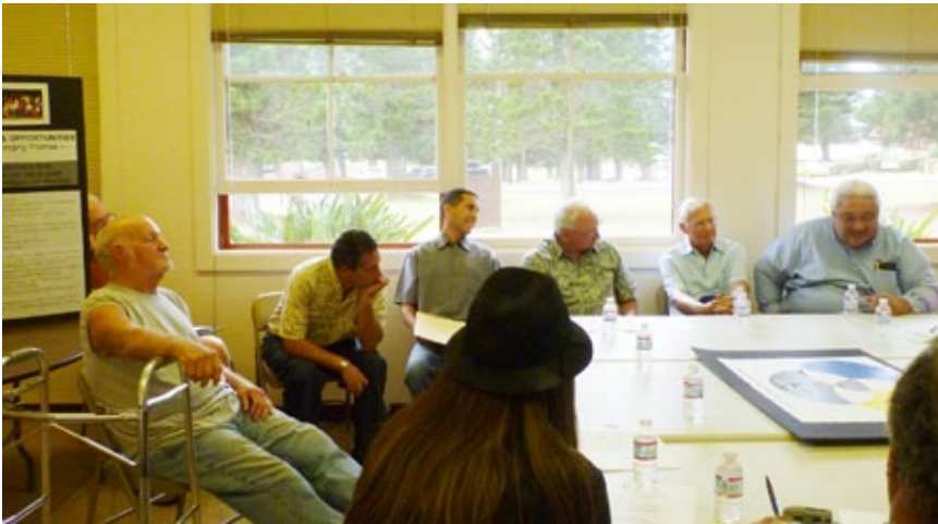
Listening visit with Lanaians for Sensible Growth at Queen Liliu'okalani Children's Center. November 3, 2011.