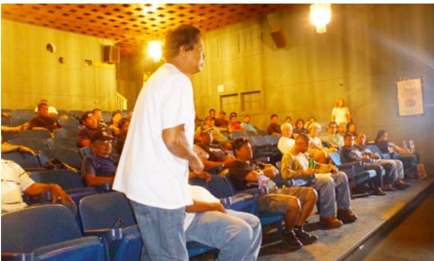
Listening visit with the International Longshore and Warehouse Union and carpenters union at the Lanai theater. November 3, 2011.

Early in November, Senator English visited the islands of Molokai and Lanai. Concerns have been raised regarding the proposed 200-megawatt wind-farms on these islands and the undersea cable linking them to Oahu. In response to this, Senator English and the members of the Hawaii State Senate Committee on Energy and Environment as well as members of the State House Committee on Energy and Environmental Protection set up numerous listening sessions with the communities on both islands.