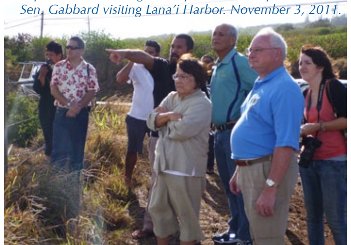
Moloka'i community representatives show Senate and House Energy Committee members proposed site for windmills in Westend Moloka'i. November 2, 2011.