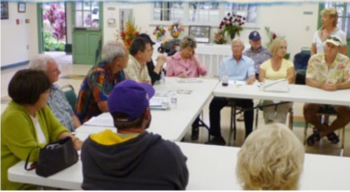
Listening visit at Lana'i High & Elementary School with Kupa'a no Lana'i. November 3, 2011.