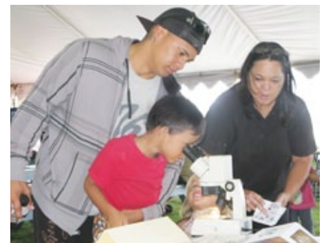
A family explores Limu at the 3rd Annual Limu Festival at Hana Bay, Nov. 5, 2011.