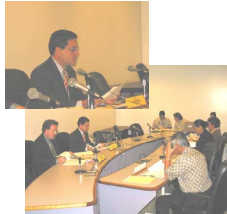
Decision making in Conference