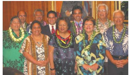
In the Governor's Office with OHA Trustees

In a victory for the Office of Hawaiian Affairs (OHA), the Governor has signed into law House Bill 1307, HD1 SD1, authorizing the release of over nine million dollars in back payments from ceded land revenues. Senator English attended the signing ceremony held on April 23, 2003 welcoming Act 34 with OHA trustees and members from both the House and Senate.